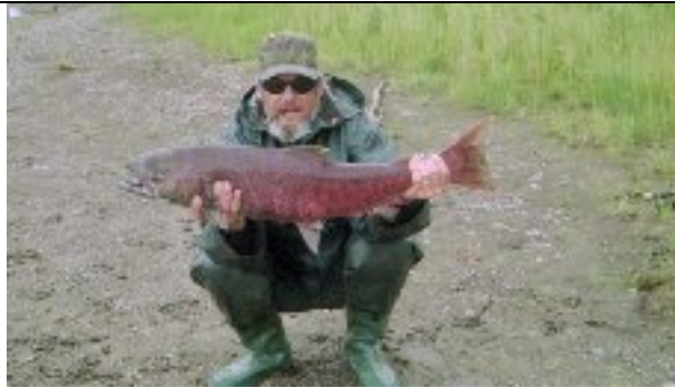
This is a fair king salmon but they get much bigger!

The Nushagak River has the worlds largest king salmon runs. We offer discounts for groups larger than 4 and family discounts. Check for internet specials.